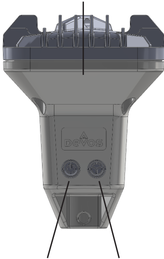
Power button Boost button